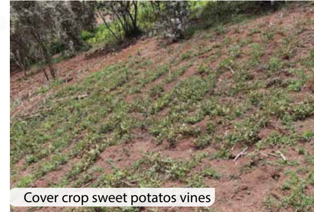
Cover crop sweet potatoes vines