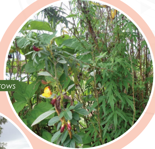
Mixed species hedgerows