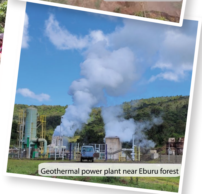
Geothermal power plant near Eburu forest