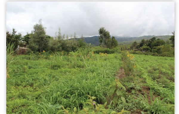
Agroforestry, hedgerows, inter-cropping and keystone species