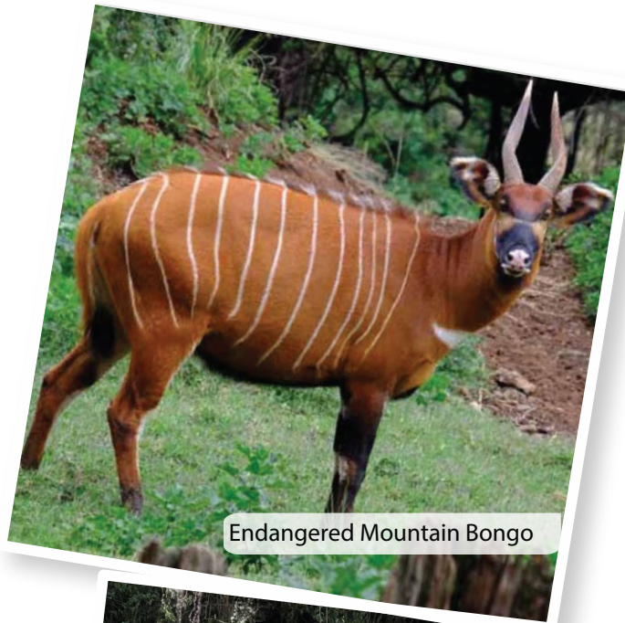
Endangered Mountain Bongo

The overall aim of the walking workshop was to strengthen KNT's knowledge platform for effective production, coordination and exchange of biodiversity and ecosystem services information by weaving multiple knowledge systems, and thereby to contribute to Kenya's efforts towards land degradation neutrality and pollinator conservation, which in turn promote and enable living in harmony with nature.