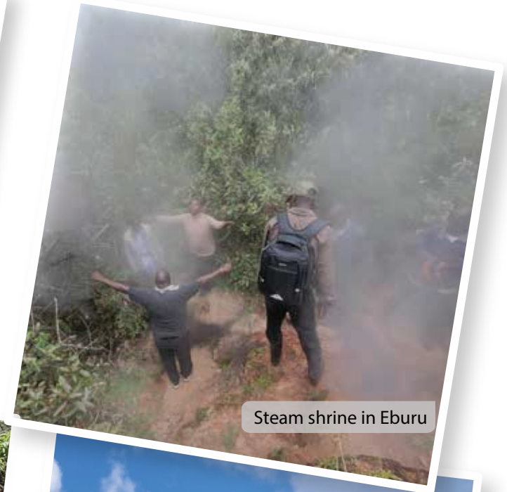
Steam shrine in Eburu