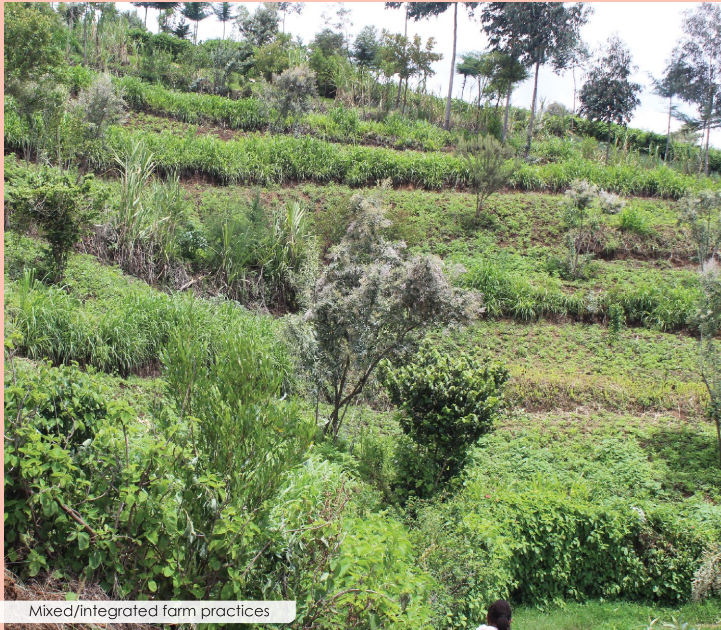
Mixed/integrated farm practices